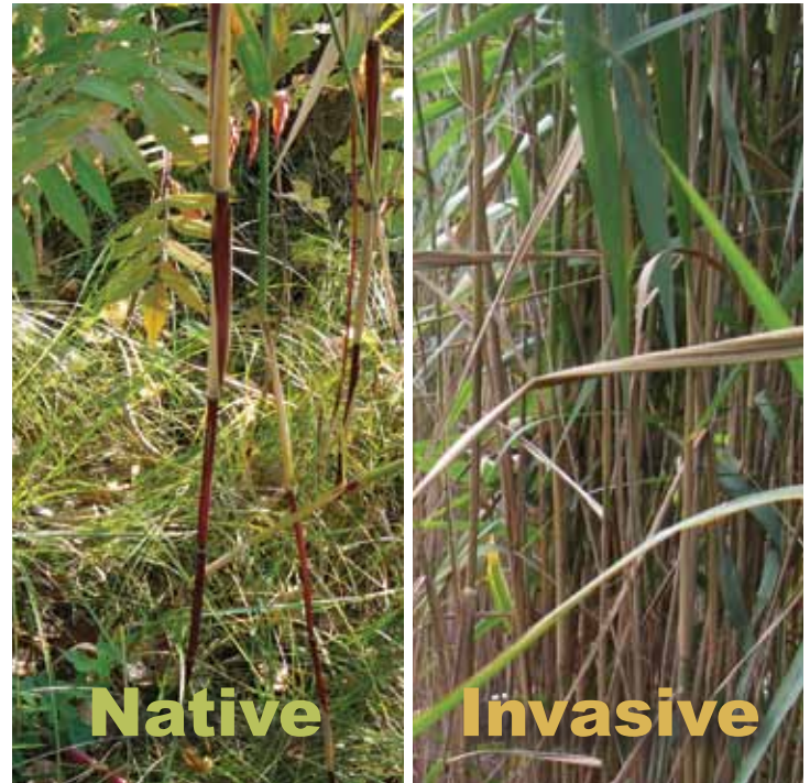
Figure 2: A native Phragmites stem (left) and an invasive Phragmites stem (right). Note the reddish brown native stem on the left, and the tan/beige invasive stem on the right.

Native stand photo courtesy of Erin Sanders, MNR. Invasive stand photo courtesy of Janice Gilbert, MNR.