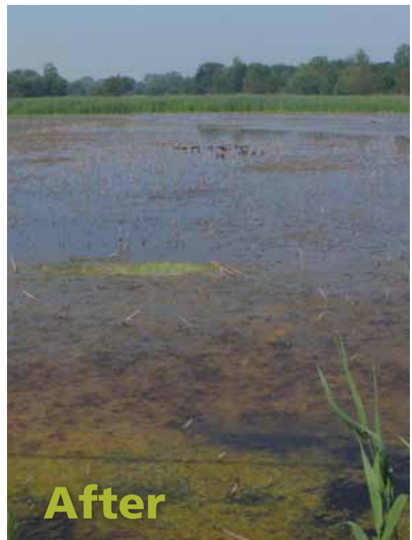
Figure 5: A study site at MacLean's Marsh, using 5% glyphosate. Before: Pre-treatment, 2007. After: Post-treatment, 2008. Note: There was no standing water in this area at the time of treatment.