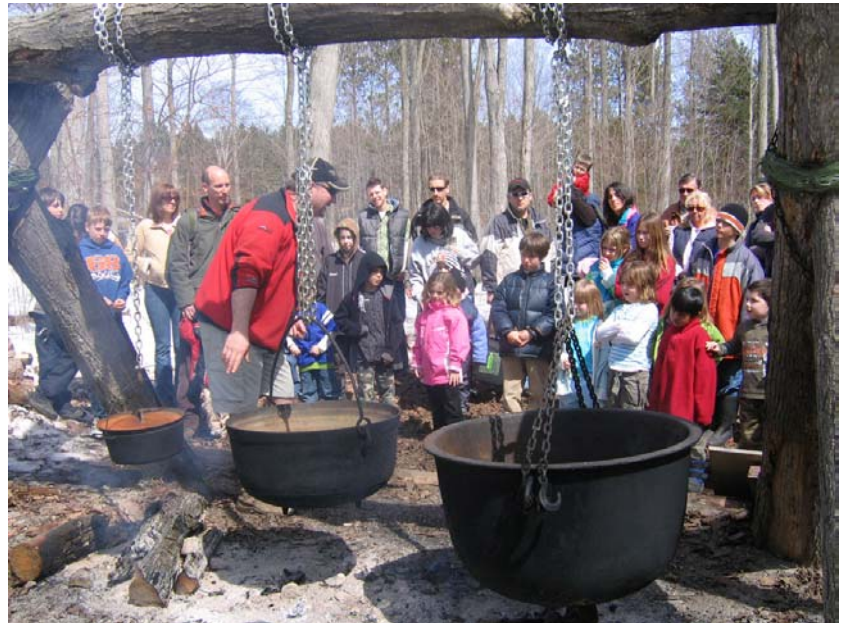
Families gather to learn how maple syrup travels from the tree to the table. It takes 40 litres of sap to make one litre of syrup.

There will also be live music, horse-drawn wagon rides, children’s arts and crafts, guided hikes, bird box building, a low ropes challenge course and an environmental fair featuring agencies that are working to protect and enhance our natural world.