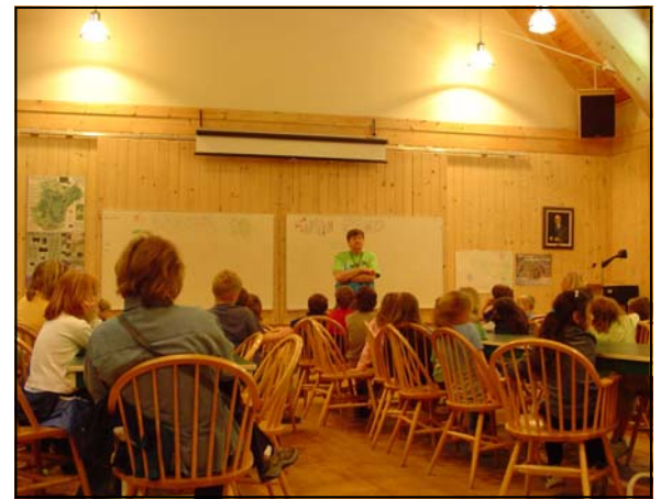
The John L. Jose Environmental Learning Centre