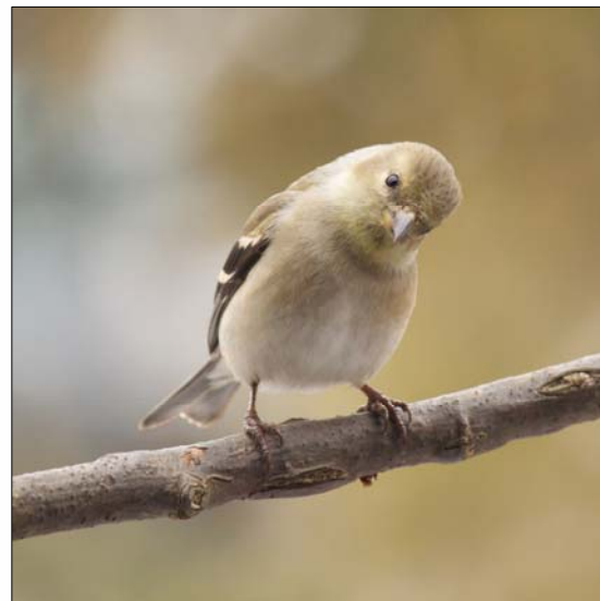
How you doing?

While taking many shots I thought it might look mysterious to slow the waterfall down, to get the feeling of the water