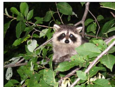
Baby racoon

Celebrating 50 Years in Conservation 1960-2010