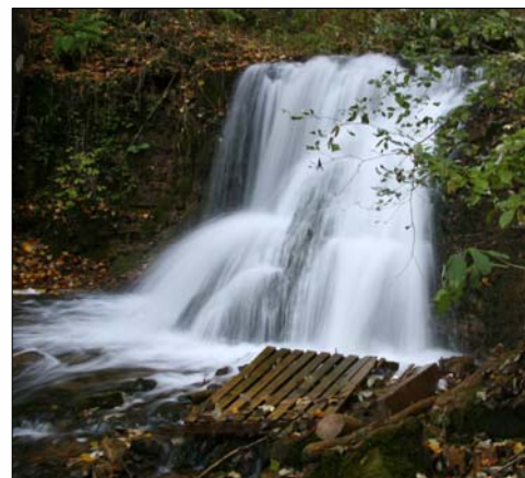
Pine River at Hornings Mills