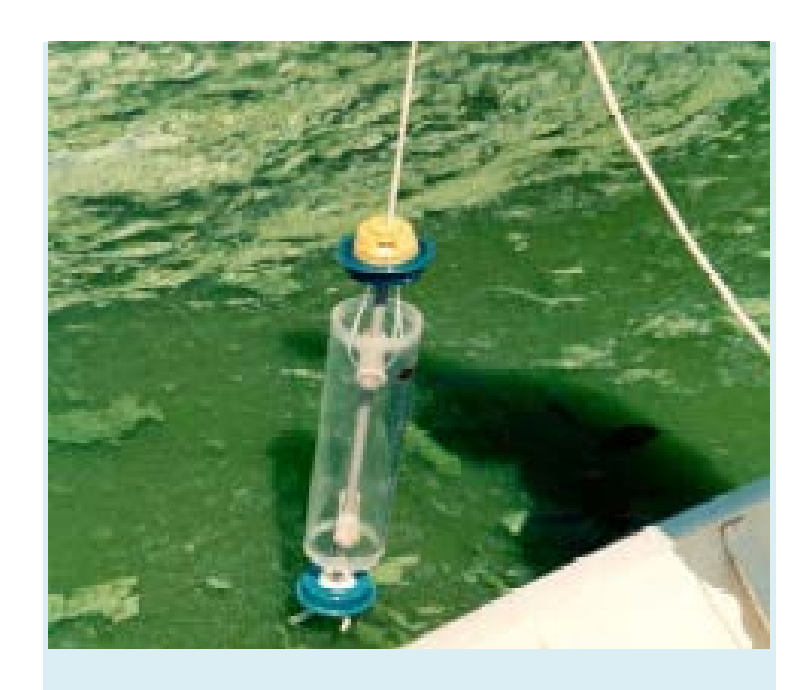
A single kilogram of phosphorus can contribute to 300-500kg of algae!