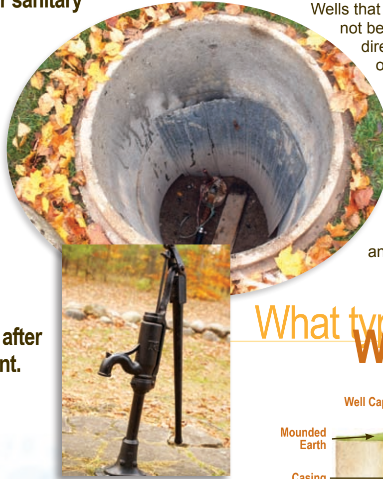
Do you have a well that needs decommissioning?