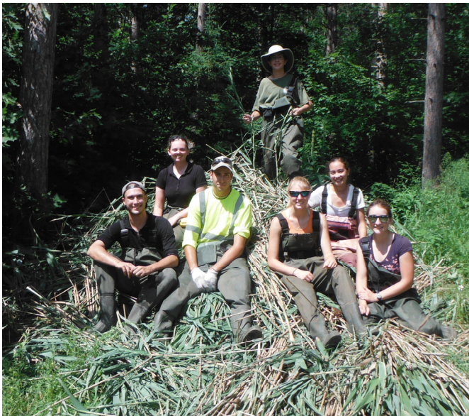
Cutting invasive Phragmites