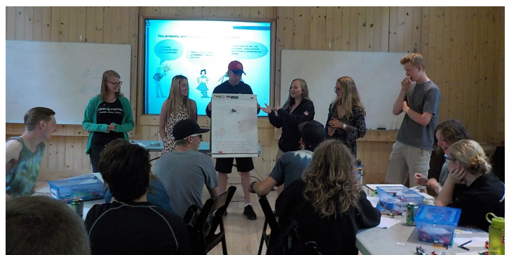
Studying benthic invertebrates, pond ecosystem evaluation, ICE presentations (L-R)