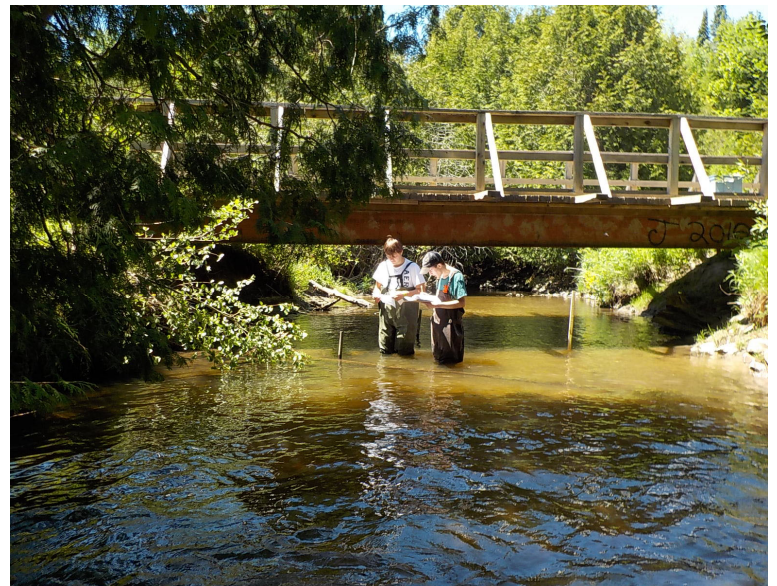
Stream Assessment: measurements and characteristics