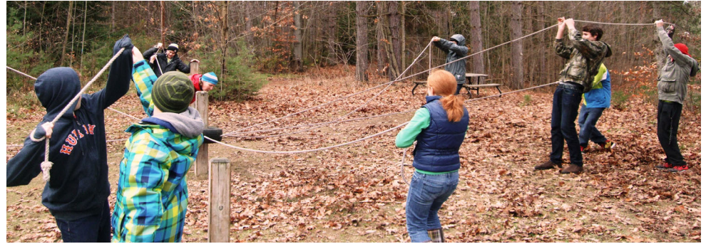
Gaining leadership skills through the low-ropes challenge course at the Tiffin Centre for Conservation.

Our hands-on learning program is designed give students real-world experiences and skills.