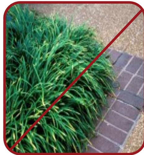
Creeping Lily Turf