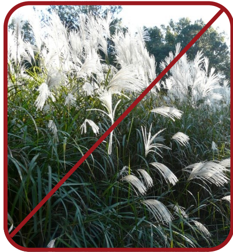
Chinese Silver Grass

Commonly found along shorelines and ditches, these plants threaten ecosystems by forming dense stands that crowd out native species. They also impact recreation and tourism by impeding shoreline views and access to water. Get to know which invasive grasses to avoid, and try substituting for native grasses.