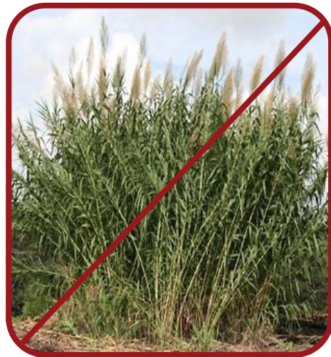
Giant Reed Grass