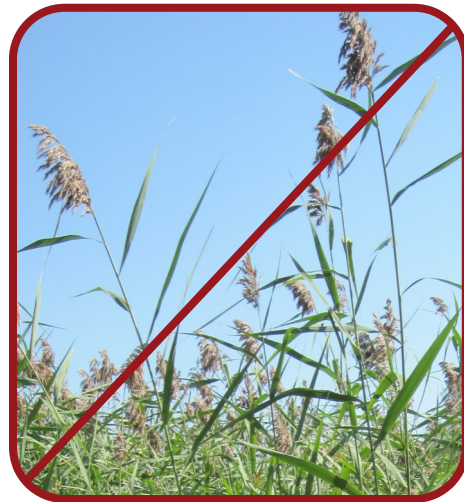
Common Reed Grass