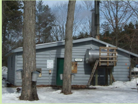
Tiffin Sugar Shack