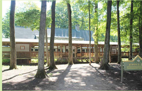
Jose Learning Centre