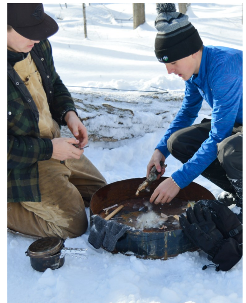
Fire &/or Emergency Shelter Building