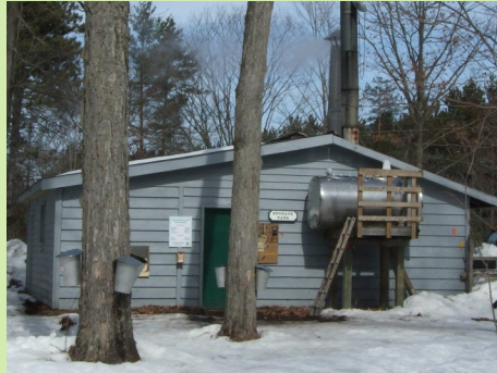
Tiffin Sugar Shack